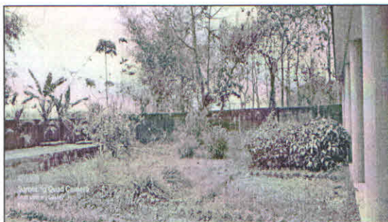
Pic: Herbal Plantation

2. Objectives of the practice: The objectives of herbal plantation in the college campus is to cultivate and conserve of medicinal plants.